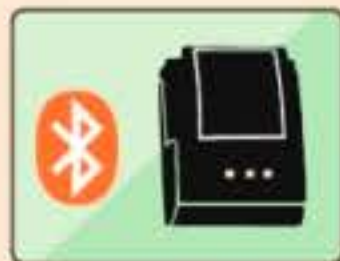
Optional Bluetooth printer